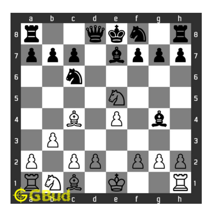
Figure 1.1: Solve this medium chess puzzle 0017. Your queen is lost. What would you do? @ https://gbud.in/g9fwbz2