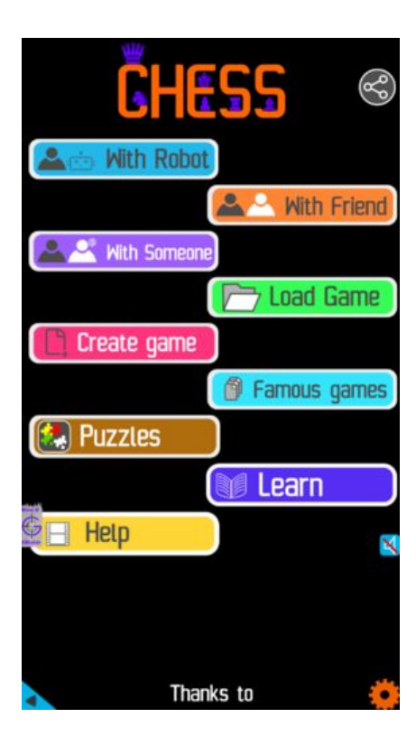
Figure 1.7: Play chess online for free. Solve puzzles and play with friends

Play chess for free at https://gbud.in/chs